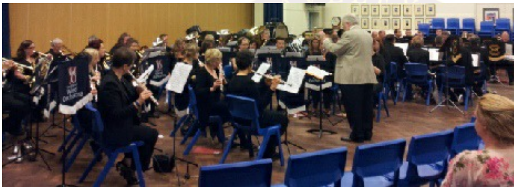
The band were very excited to be performing in a joint concert with the Southend Wind Orchestra in Rayleigh, Essex.