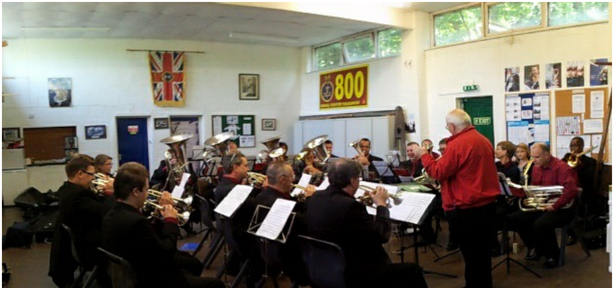
The band rehearsing on the day before the Masters contest